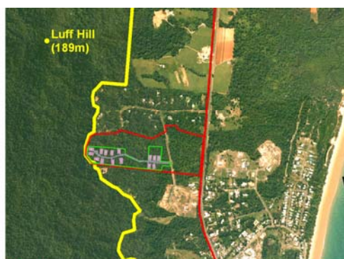
Lot 66 boundary Private ownership approx 4000 sq mtrs proposed house lots approx 850 sq mtrs