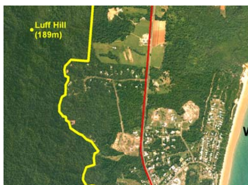
Map as of Dec 08

The proposal is to develop the land for 15 low density residential allotments, of about 4,000 m 2 each and infrastructure such as fencing, services, a private road and a common property conservation land and conservation corridor.