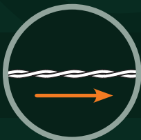
Continuous Length - No Joins