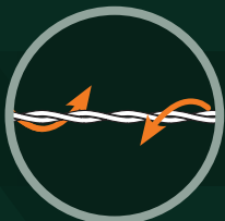
Reverse Twist Style 2 x 1.8mm