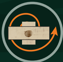
Coiled on hardwood spools